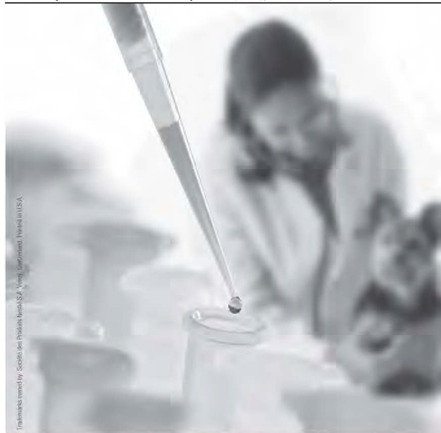
Trademarks owned by: Sachtel, Iden, Produkte Nestlé S.A., Vevey, Switzerland. Printed in U.S.A.

A heroic effort, that's virtually effortless.